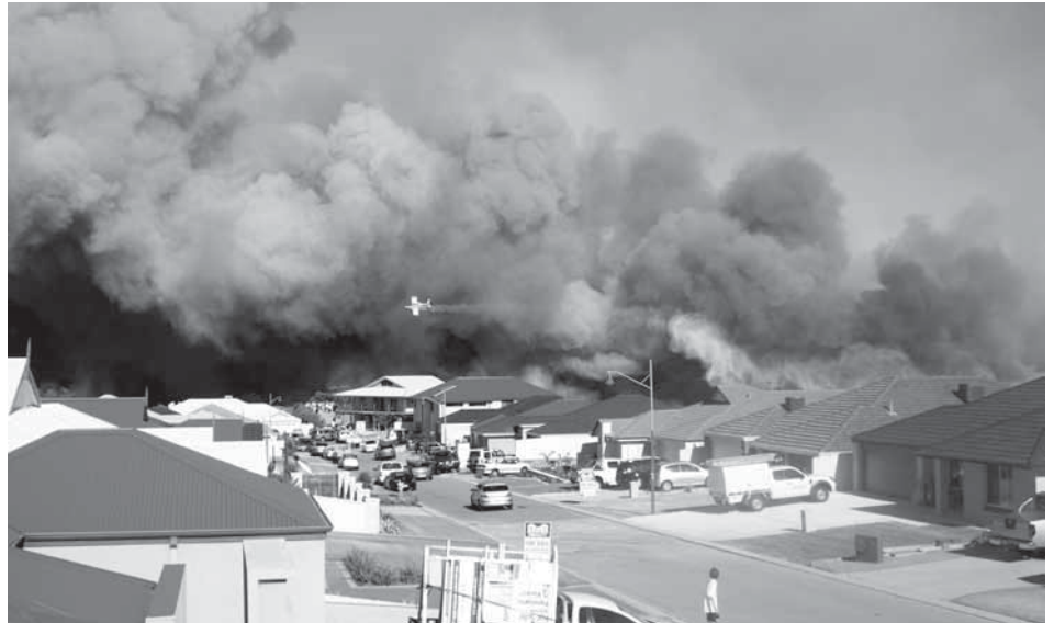
Fire threatening Secret Harbour in December

The events that have occurred this summer also highlight the huge