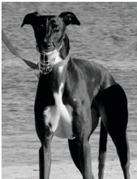
Max needs a home